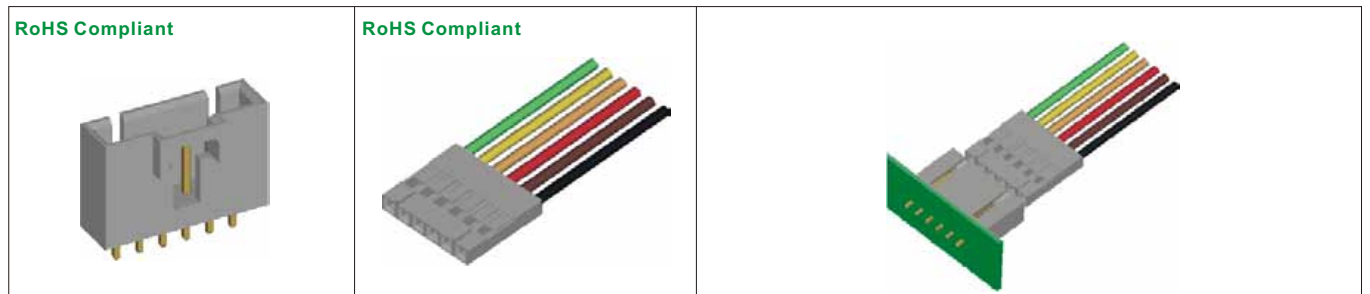
3750S-XX No. Of Positions S: Straight Type R: R/A Type 3750H-04 No. Of Positions (4 Ways only) H: Housing 3750 Series: 2.54mm Pocket Header Straight & R/A Type 3750H Series: 2.54mm Pocket Housing Connector Mating Part: 3750S-XX Mating 3750H-04

2000 Arctic Ave, Bohemia, NY, 11716 Tel: 1-800-346-3532