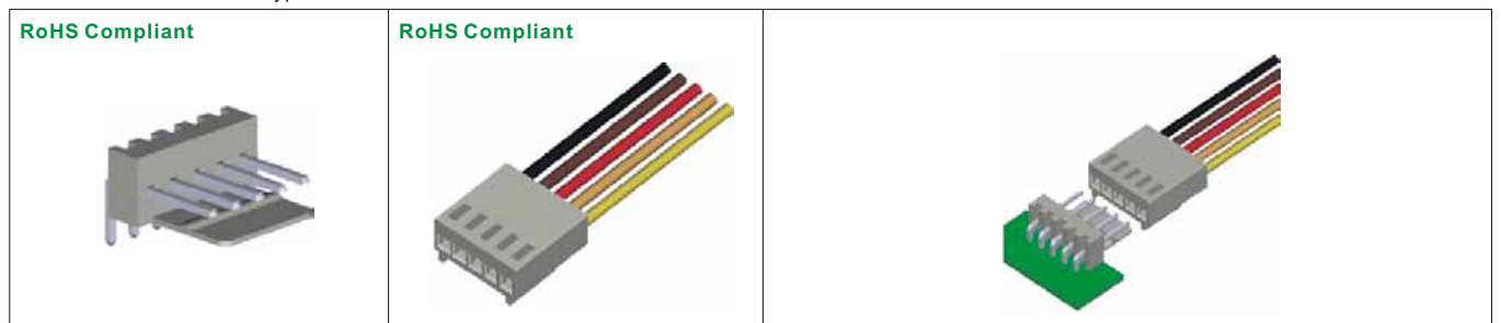
2217S-XX No. Of Positions S: Straight Type R: R/A Type 2218H-XX No. Of Positions H: Housing 2217 Series: 2.54mm Wafer Straight & R/A Type 2218H Series: 2.54mm Housing Connector Mating Part: 2217S-XX Mating 2218H-XX