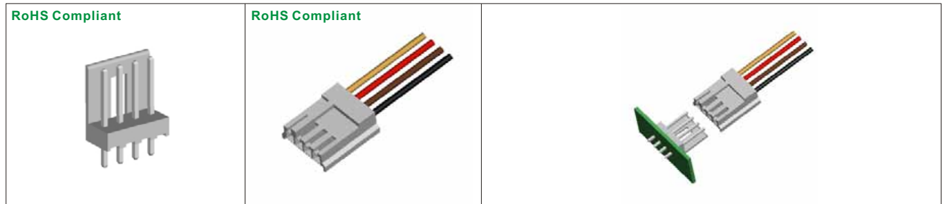
8982S-XX No. Of Positions S: Straight Type R: R/A Type 8982H-XX No. Of Positions H: Housing 8982 Series: 2.5mm Wafer Straight & R/A Type 8982H Series: 2.5mm Housing Connector Mating Part: 8982S-XX Mating 8982H-XX