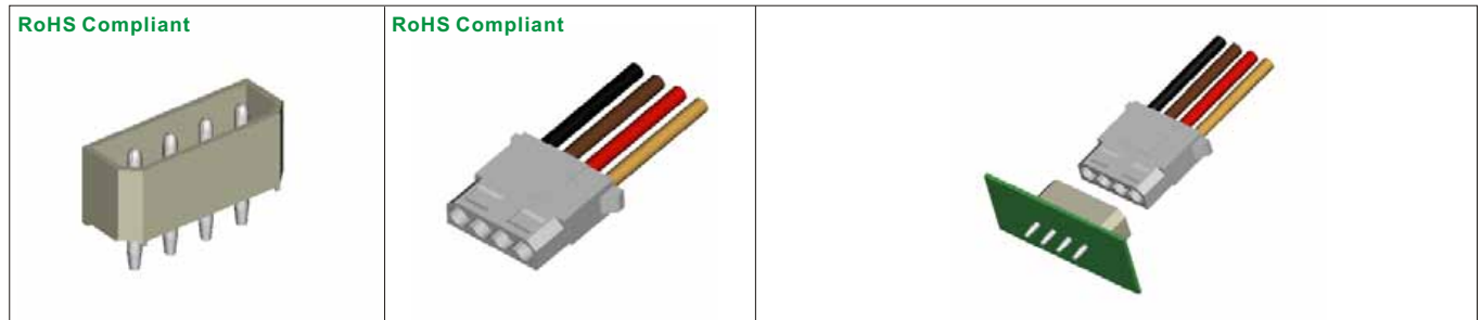
8981S-04 No. Of Positions S: Straight Type R: R/A Type