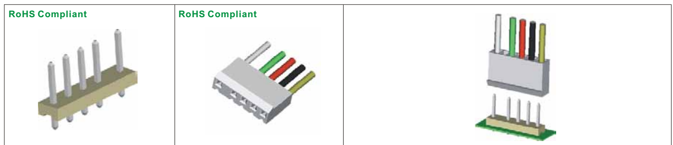
5289S-XX-01 01: W/O Lock No. Of Positions S: Straight Type R: R/A Type